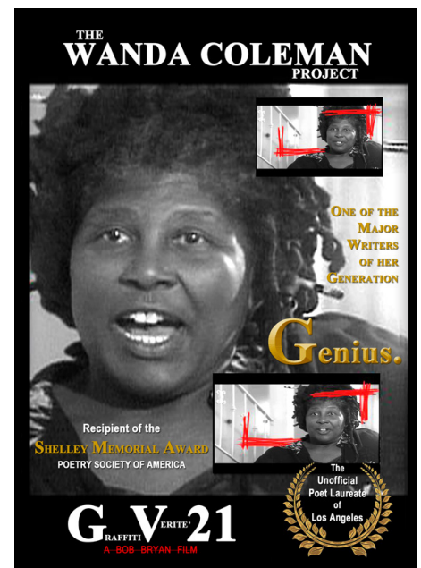
GV21 Front Cover